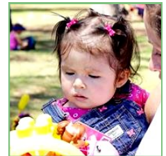
Serving 416 children in five Long Beach locations

Kohn Center/Main Office 501 Atlantic Ave.