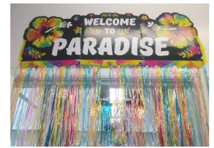
Left: gifts prepared by one of our teachers for her co-workers. Above: the administrative office was transformed into "paradise" on administrative professionals day, because, Young Horizons is a paradise!