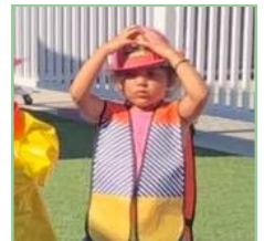
Serving 416 children in five Long Beach locations

Kohn Center/Main Office 501 Atlantic Ave.