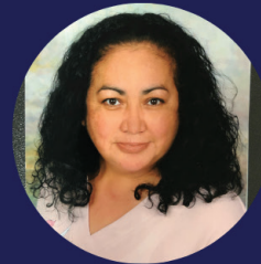
Nancy Ramirez Caring Award