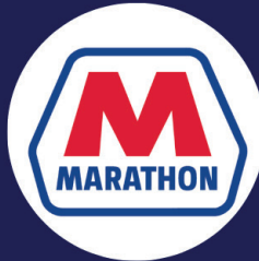
Marathon Petroleum Champion of Children Award